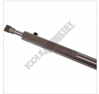
Carbide Tip Secured With Grub Screw