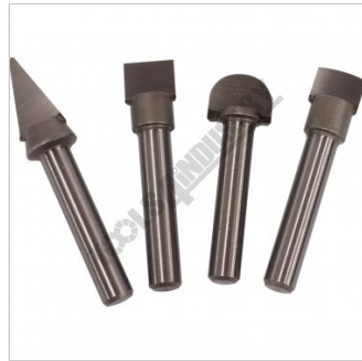
4 x Carbide Cutting Tips