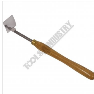
Shown With Guard