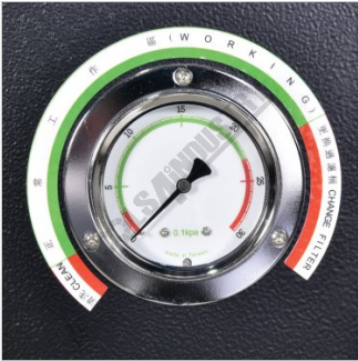
Differential Pressure Gauge