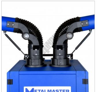
Dual Exo Joint with Gas Strut Supports