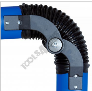
Exo Centre Arm Joint