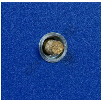
Inlet Spark Arrestor