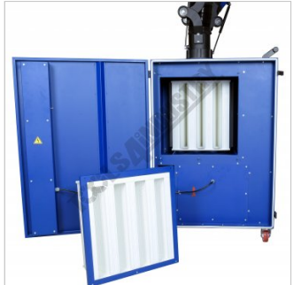
Dual H13 Hepa Filter