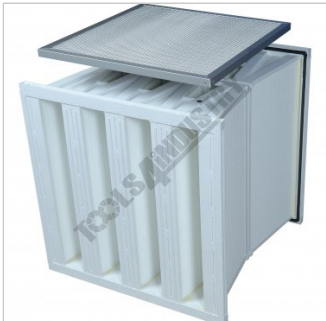
Pre Filter & Hepa Filter System