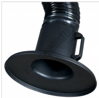
Fume Extraction Head