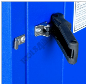
Quick Action Door Panel Locks