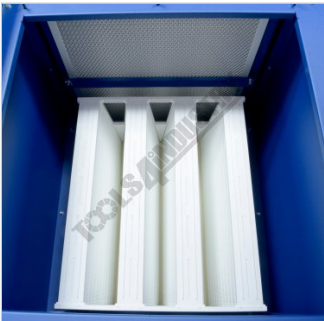
H13 Hepa Filter Assembly