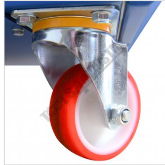
2 x Swivel Wheels