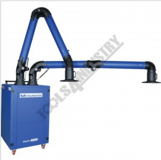
3 Metre Arm Extended