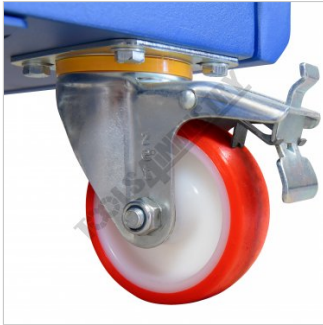
2 x Swivel Lock Wheels with Brake