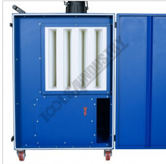
Right Side Door Access Panel