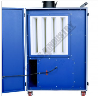
Left Side Door Access Panel