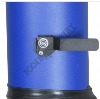
Air Flow Control Valve