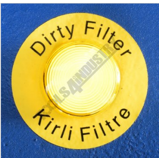
Dirty Filter Light Indicator