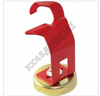
Top Left View