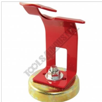
Rear Top View