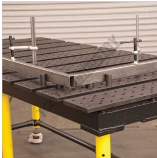
The Stops Provide Low Profile Locating and Make Workpiece Removal Easy