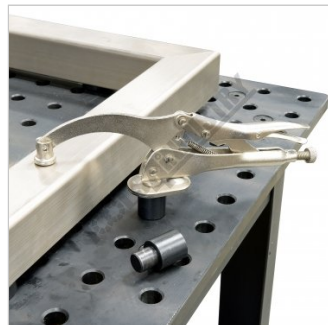
Optional Clamp C103 shown screwed into Threaded Riser