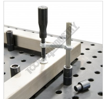
Optional SC 60 Clamp Shown Screwed into Threaded Adaptor