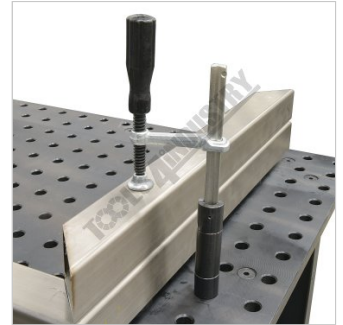
Optional Threaded Riser & Adaptor (W08513 & W08515)