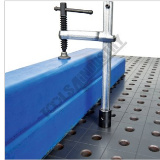
Shown Clamping 2 Lengths of Square Tube