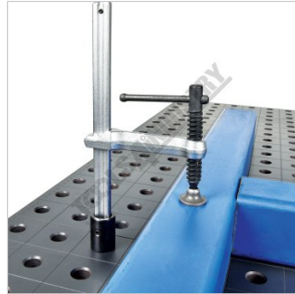
Shown Clamping Square Tube