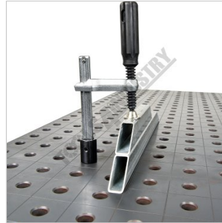
Shown Clamping 2 Pieces of Rectangular Tube