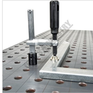
Shown Clamping Rectangular Tube