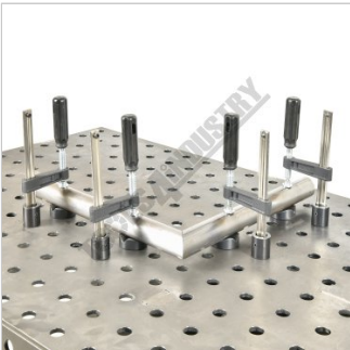
Round Tube Setup with Extra 2 Clamps and V Pads