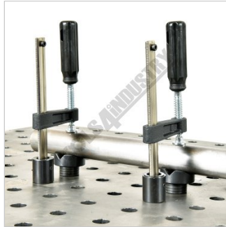
Clamps Shown Clamping Round Tube