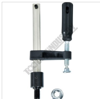
4 x SC 50 Weld Clamps with Locking Nuts