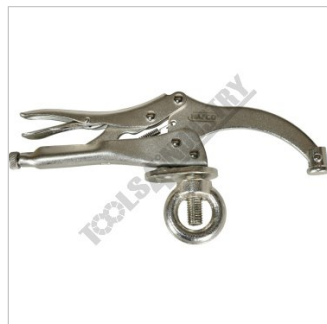
2 x VGP9 Drill Press Locking Clamp