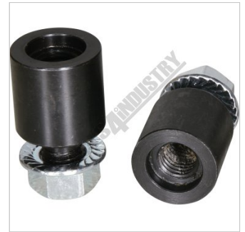
4 x SCA 253M 25mm Multi Purpose Threaded Stop