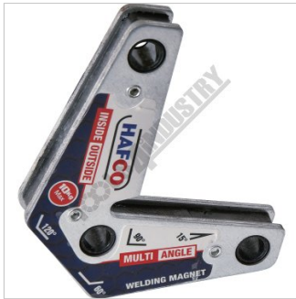
2 x WCM 4A Multi Angle Corner Magnets