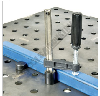
Clamp Shown Clamping Square Tube