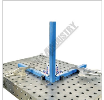
Square Tube Setup with Stops Locking Clamps and Magnetic Squares