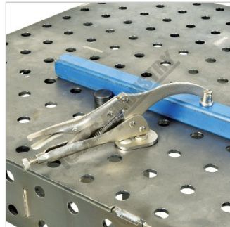
Shown Clamping Square Tube