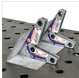
Mult Angle Magnet Shown Setup in 60 Degrees