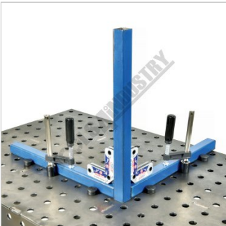
Square Tube Setup with Stops Clamps and Magnetic Squares