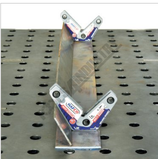
Mult Angle Magnet Shown Setup in 120 Degrees Long Length