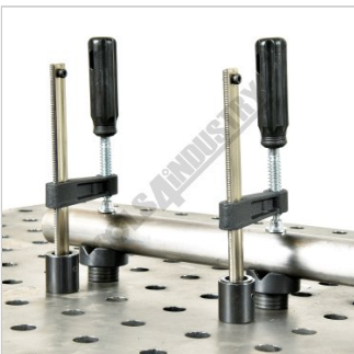
Clamps Shown Clamping Round Tube