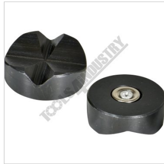
4 x SCVM 90135 Magnetic Cross Type 90 and 135 Degree V Pad