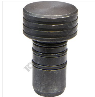
6 x SCLP 16 Locating Pin 16x40mm