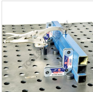
Square Tube Setup with Clamp on a Riser