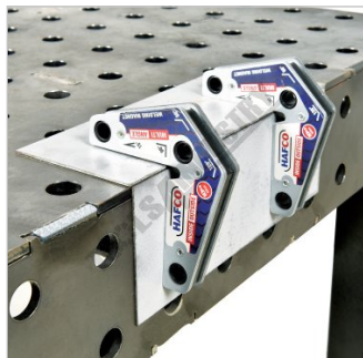
Mult Angle Magnet Shown Setup in 90 Degrees