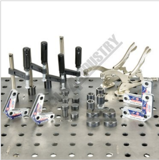
Kit Shown on Welding Table