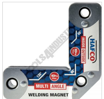
2 x WCM 3A Multi Angle Corner Magnets