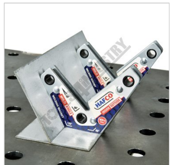
Mult Angle Magnet Shown Setup in 120 Degrees