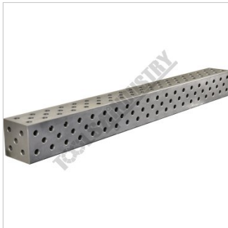
Riser Block 200x200x200mm