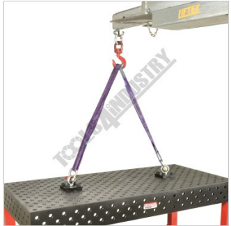
Shown using optional lifting kit