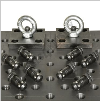
Table-accessory lifting kit