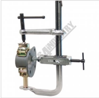
Shown Mounted to Clamp