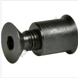
Hex Key Lock