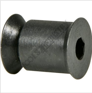
Countersink Lock Pin 16x24mm