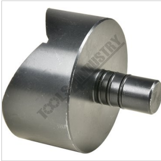
16mm Diameter Shank