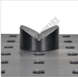
Shown on Welding Table