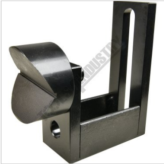
Shown Setup with Optional Riser