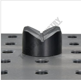
Shown on Welding Table