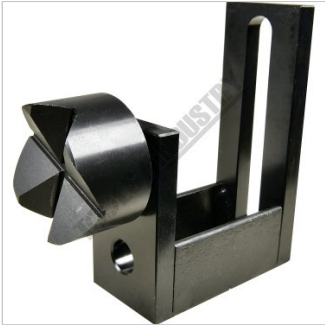
Shown Setup on Optional Riser