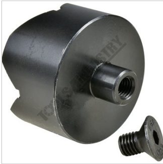
16mm Diameter Shank