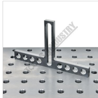
Shown on Welding Table