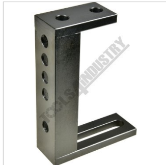
Clamping Square 200mm