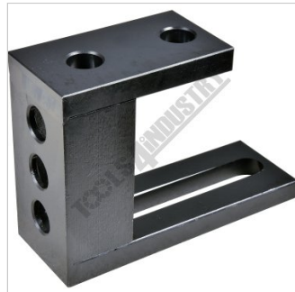
Clamping Square 100mm