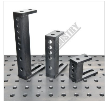
100mm 200mm 300mm Range Available