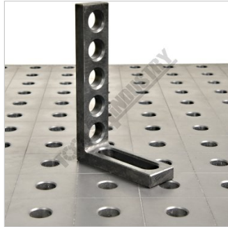
Shown on Welding Table