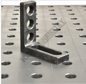
Shown on Welding Table