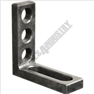
Angle Bracket 90x90x30mm