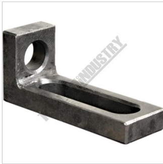
Angle Bracket 90x40x30mm