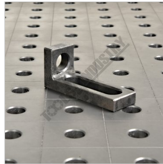
Shown on Welding Table