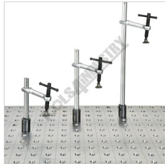
Optional Range Available