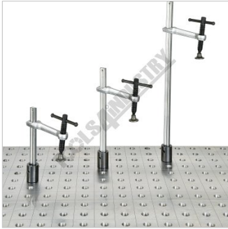
Optional Range Available