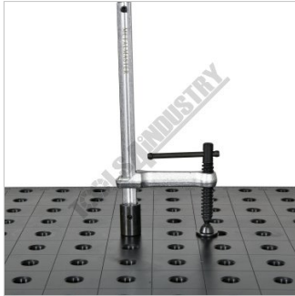
250mm Clamp Height