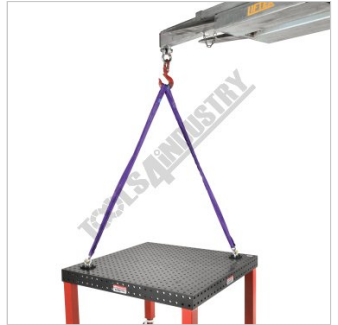
Shown Using Optional Lifting Kit