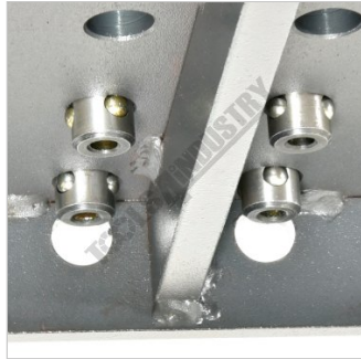
Bottom View on Welding Table