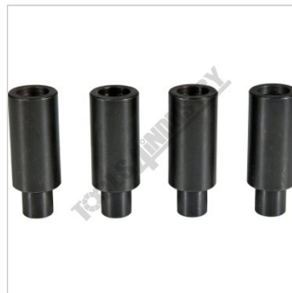
50mm Material Stop