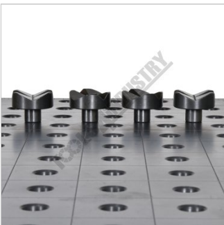
Cross Type 90 / 135° V-Pad