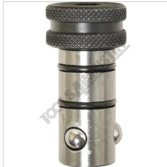
Ball Lock Pin 16 x 24mm