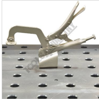
Welding Table Rapid Clamp