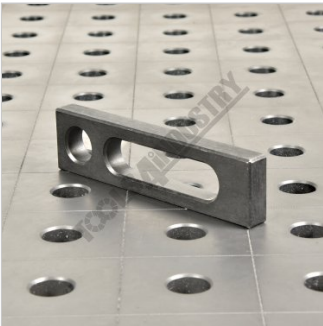
Straight Bar Stop