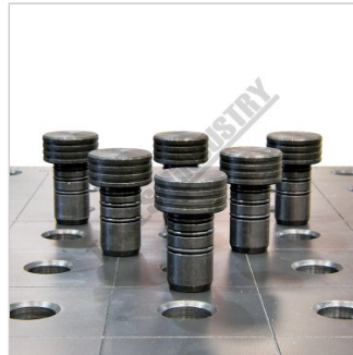
Locating Pin 16 x 40mm