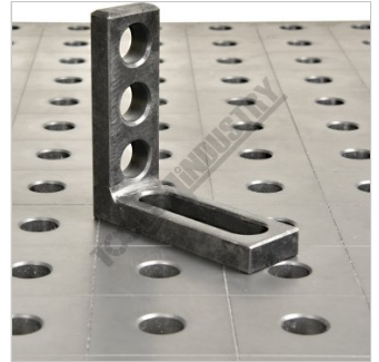
90 x 90 x 30mm