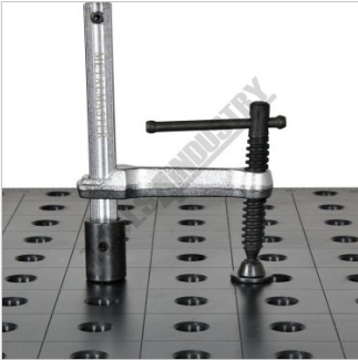
150mm Clamp Height