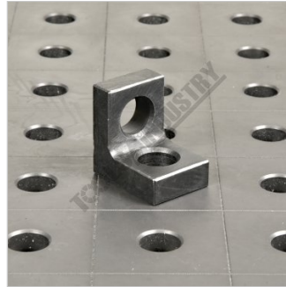
40 x 40 x 30mm