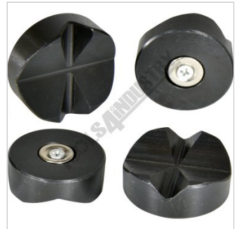
Magnetic Cross Type 90 / 135° V-Pad