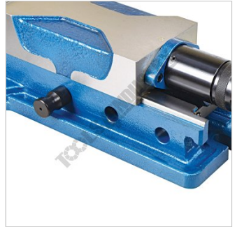
3 Pin Position Clamping Range