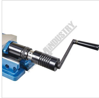
Hydraulic Tension with Handle