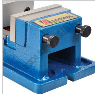
Knurled Head Lifting Pins