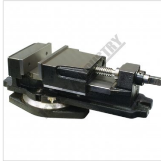
Shown without Handle