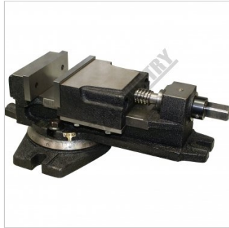
Shown without Handle