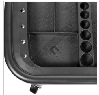
Magnetic Tray Slot