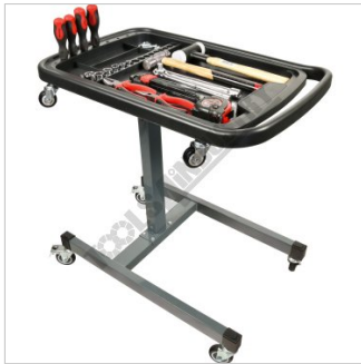
Tools Not Included