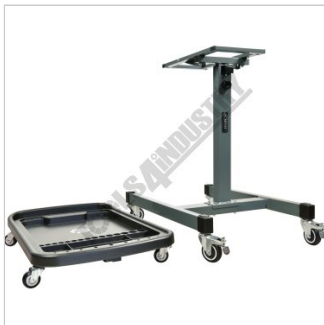
Tray and Stand Separate