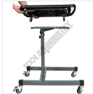
Removeable Top Tray