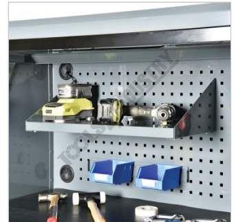
Includes Large Shelf Shown With Optional Power Tools