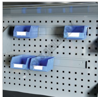
Includes 2 Bucket Holder Brackets With Optional Buckets