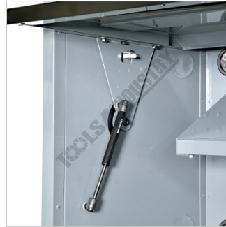
Gas Strut Lid