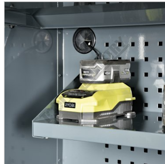
Includes 4 Power Inlets Shown With Battery Charger Not Included