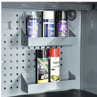
Includes 2 Shelf Containers Shown With Optional Spray Cans