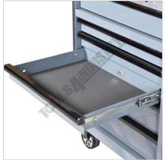
Protective Drawer Liners