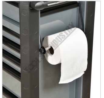
Paper Towel Holder