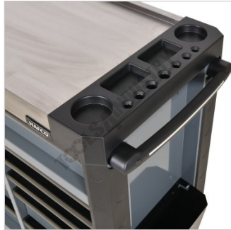
Various Tool Holders and Push Handle