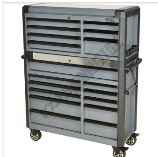
Shown with Optional TDL 447 Tool Chest