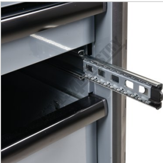
Ball Bearing Slide Drawers