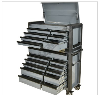
Shown with Optional TDL 447 Tool Chest Open