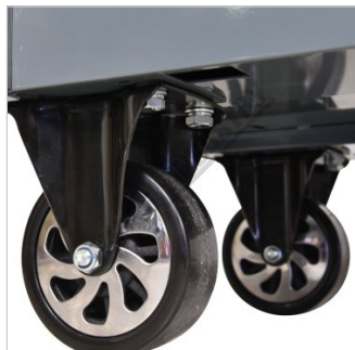
2 x Fixed Wheels