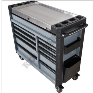
Stainless Steel Top Tray