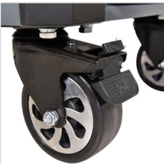
2 x Swivel Brake Wheels