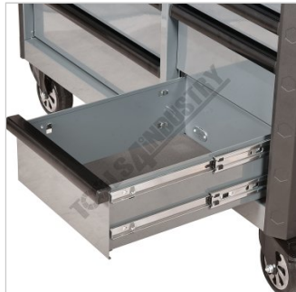
Dual Ball Bearing Slides to Deeper Drawers