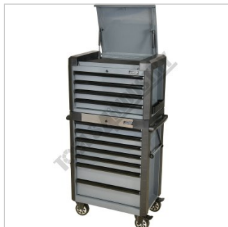
Shown with Optional TDL-287 Roller Cabinet - Lid Open