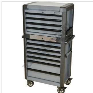
Shown with Optional TDL-287 Roller Cabinet - Lid Closed