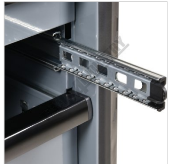
Ball Bearing Slide Drawers