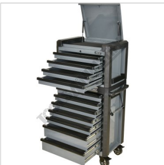
Shown with Optional TDL-287 Roller Cabinet