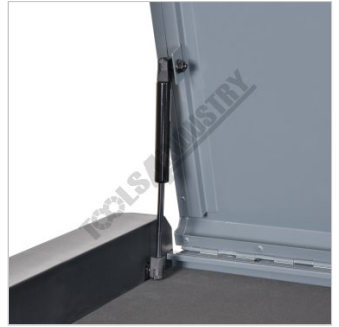
Gas strut lid