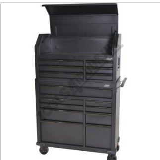
Shown with Optional TIS-426 Tool Chest - Lid Open