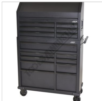
Shown with Optional TIS-426 Tool Chest - Lid Closed