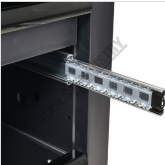
Ball bearing slide drawers