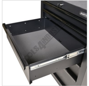
Protective drawer liners