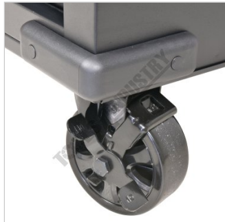
2xswivel brake wheels