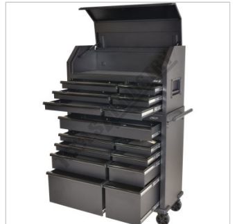
Shown with Optional TIS-426 Tool Chest