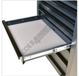
Protective Drawer Liners