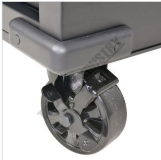
2xswivel brake wheels