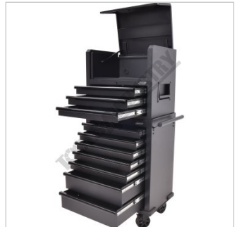
Shown with Optional TIS 263 Tool Chest