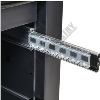
Ball bearing slide drawers