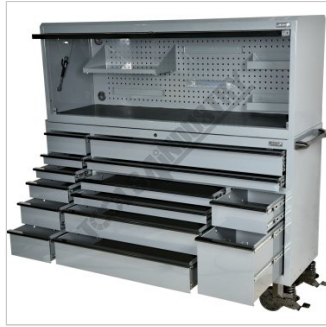
Shown with Optional TPS 7214 Tool Chest Drawers Open