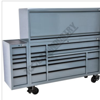
Shown with Optional TPS 75D Side Cabinet