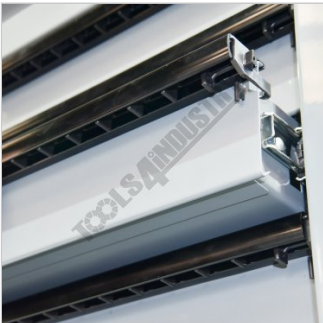
Full Width Drawer Opening Latch