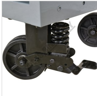
2x Swivel Brake Wheels