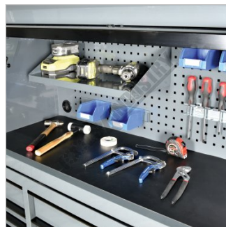
Large Bench Space With Protective Matt Shown With Optional Tools