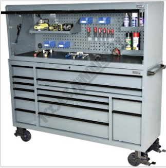
Shown with Optional TPS 7214 Tool Chest Tools etc Not Included