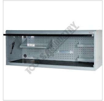
TPS 72H Top Cubby