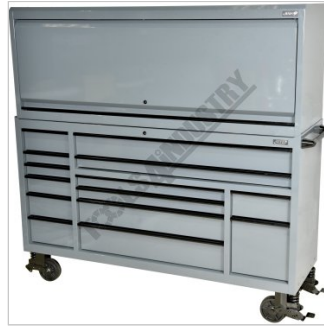
Shown with Optional TPS 7214 Tool Chest Lid Closed