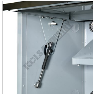
Gas Strut Lid