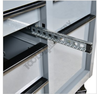
Ball Bearing Slide Drawers