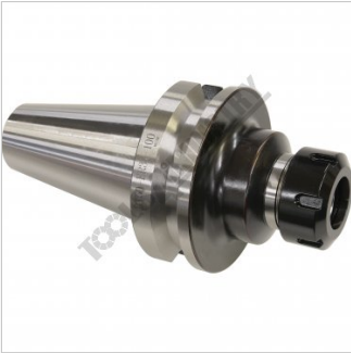
Front Right View