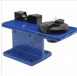
Rear Right View