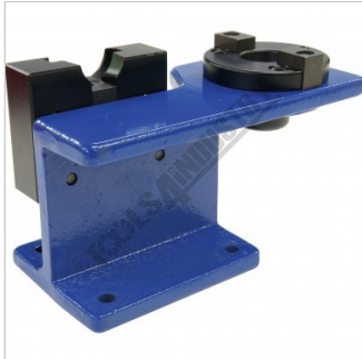
Rear Left View