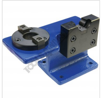
Right Top View