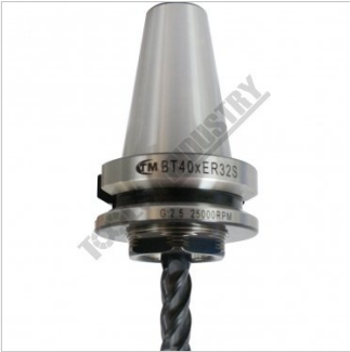
Shown with Optional Cutter