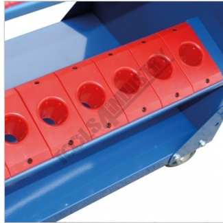
Bottom Shelf Tooling