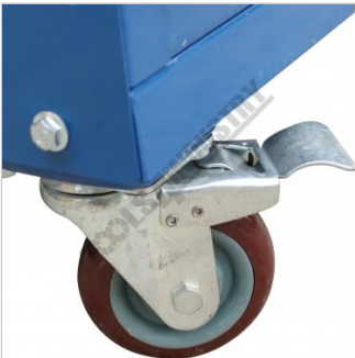
Swivel Wheel With Brake