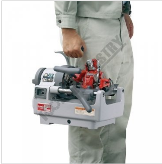
Portable with Carry handle