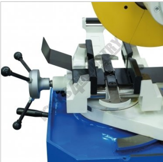
Self Centering Vice Side View