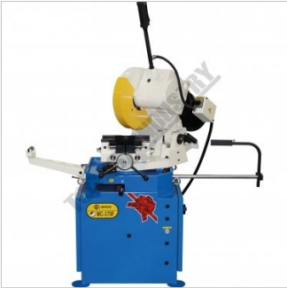
Front View Swivel Head