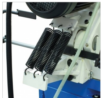
Head Return Springs