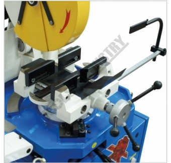
Self Centering Vice