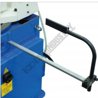
Adjustable Length Stop