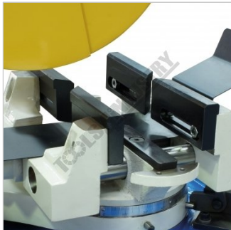
Adjustable Vice Jaws