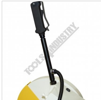
Safety Trigger Switch