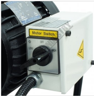
High Low Speed Switch