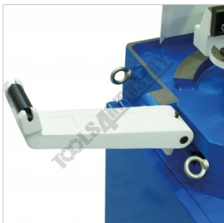
Material Support Arm