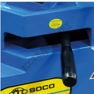
Swivel Head Release Lever