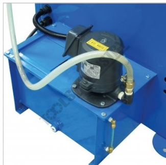
Coolant Pump and Tank