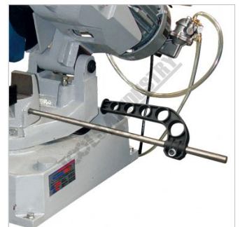
Material length stop