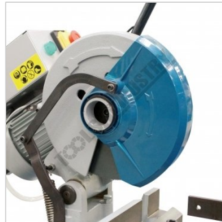
Auto Retract Safety Blade Guard