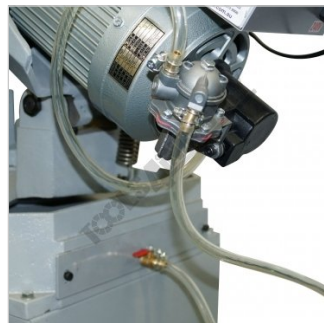
Blade Coolant System