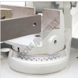
Swivel Head Scale