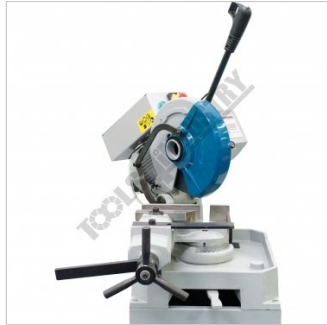
Swivel Head to 45 degrees in Both Directions