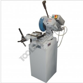
Show on Optional Stand S820