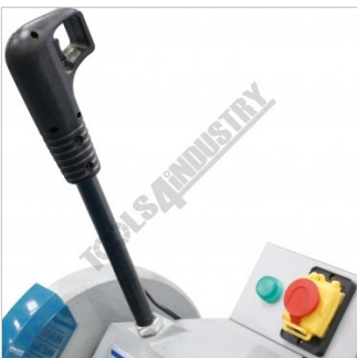
Dead Man Trigger Switch