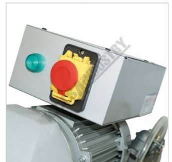
Power & Emergency Stop Switch