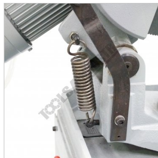
Spring Assisted Head Return