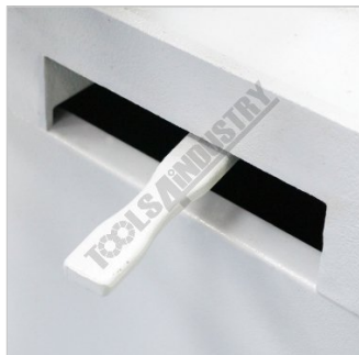
Swivel Head Locking Lever