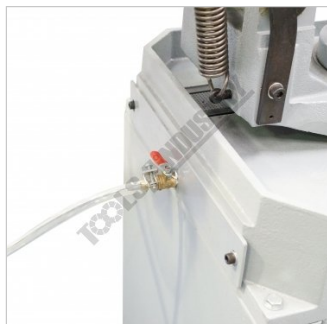
Coolant Tray Reservoir