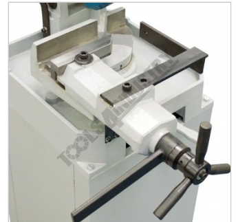
Quick Action Vice