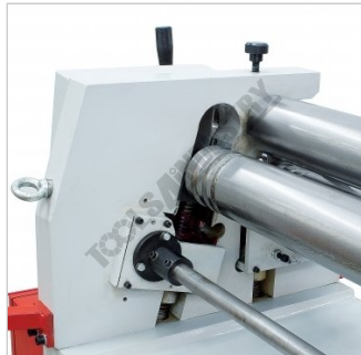
Motorised Up and Down Rear Curving Roller Left Side