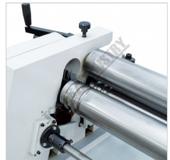
Wire Groove Rolls