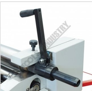
Swing Out Top Roller Handle