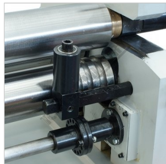
Conical Bending Guide Roller