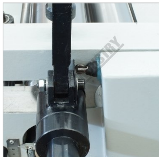
Top Swing Out Roller Micro Switch