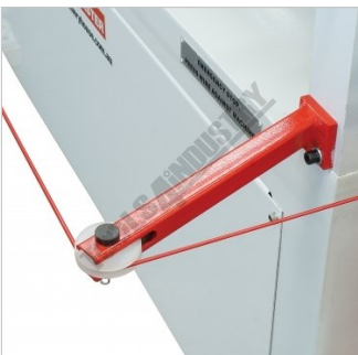
Safety Wire Interlock System