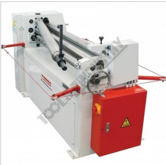
Swing Out Top Roller