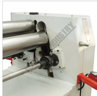
Motorised Up and Down Rear Curving Roller Right Side