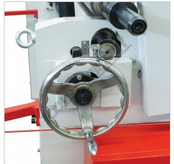
Hand Wheel For Material Thickness Adjustment