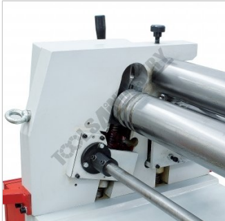
Motorised Up and Down Rear Curving Roller Left Side