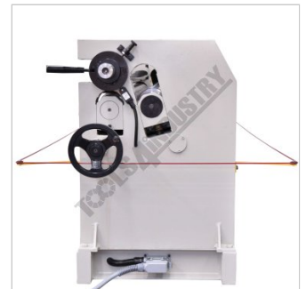
Right End View