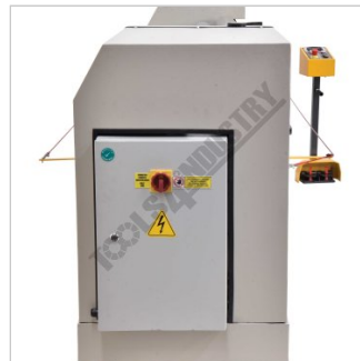
Left End View