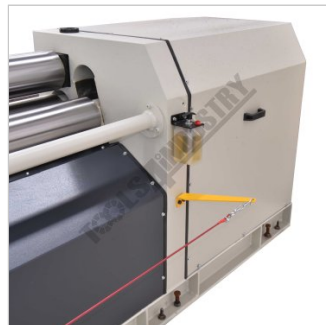
Head Rear View