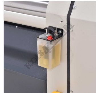
One Shot Lube Pump