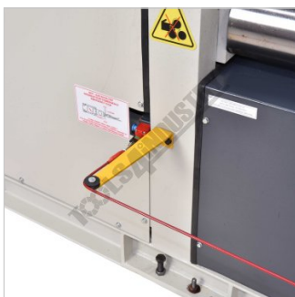
Safety Wire Interlock System