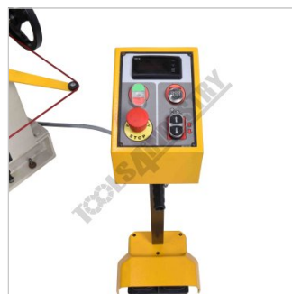
Roving Pendant Controller