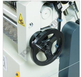
Bottom Roll Material Thickness Adjustment Handle