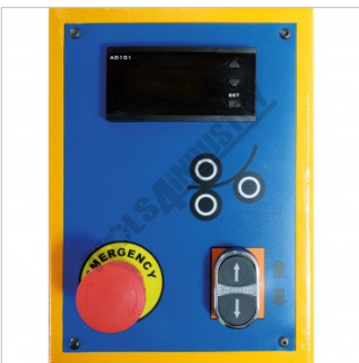
Digital Read Position Display With Emergency Stop