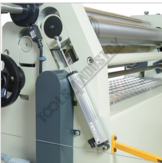
Motorised Rear Curving Roller