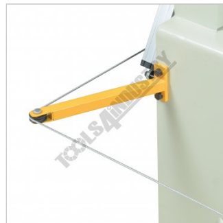
Safety Wire Interlock System Brace