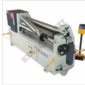
Swing Out Top Roller