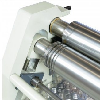
Wire Groove Rolls Rear View