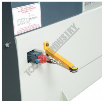
Safety Wire Interlock System