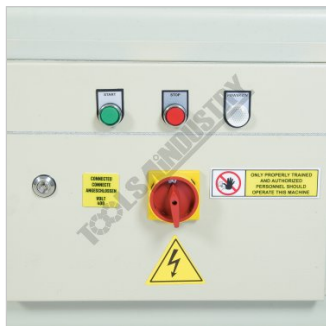
Main Power Control Panel & Isolation Switch