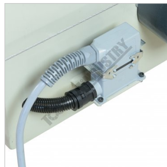
Plug In Foot Control Connector