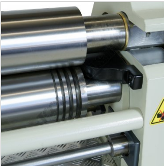
Wire Groove Rolls