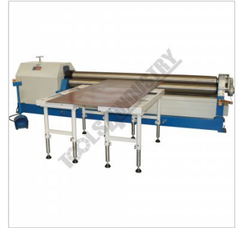
Shown with Optional Ball Transfer Tables