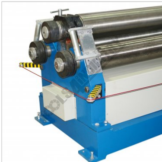
Section Roll End with Flat Bar and Pipe Dies