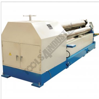
Left Rear View