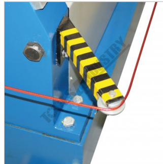
Safety Wire Interlock System