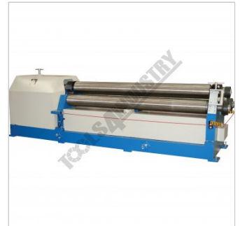
Rear View New